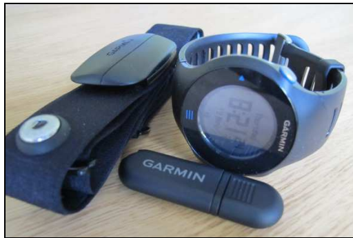
FIGURE 2: Garmin Forerunner 610 Heart Rate Monitor Watch

All participants were introduced to The Sims game and a short tutorial was given before the experiment started. During the experiment, they were given an information sheet about the game and a list of controls. We provided three experiment tasks: 1) create a Sims character (e.g. set personality, gender etc.); 2) decorate the house (e.g. design and buy furniture); and 3) fulfill and monitor the Sims basic needs (e.g. hunger, bladder, energy etc.). The participants created their own Sims character and built the Sims' virtual house.