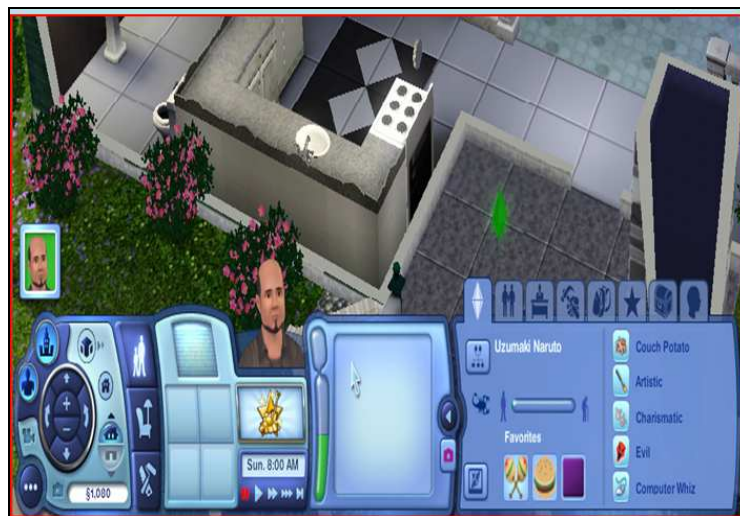
FIGURE 1: Screen shot of The Sims™ 3

All participants filled out a background questionnaire, which was used to gather information on their computer use, general computer experience with The Sims game, and demographic data such as age and gender. After the experiment, the instrument asked about what they liked about the game and their experience with the game, including player satisfaction and overall comment about the game experiment. Participants were divided into novice and non-novice according to the demographic background and experiences in playing the game. In this experiment, the Sims 3 game options were chosen (e.g. 'free will' option was turned off) so that the participant could play in the same environment (see Figure 1 for a screen shot).