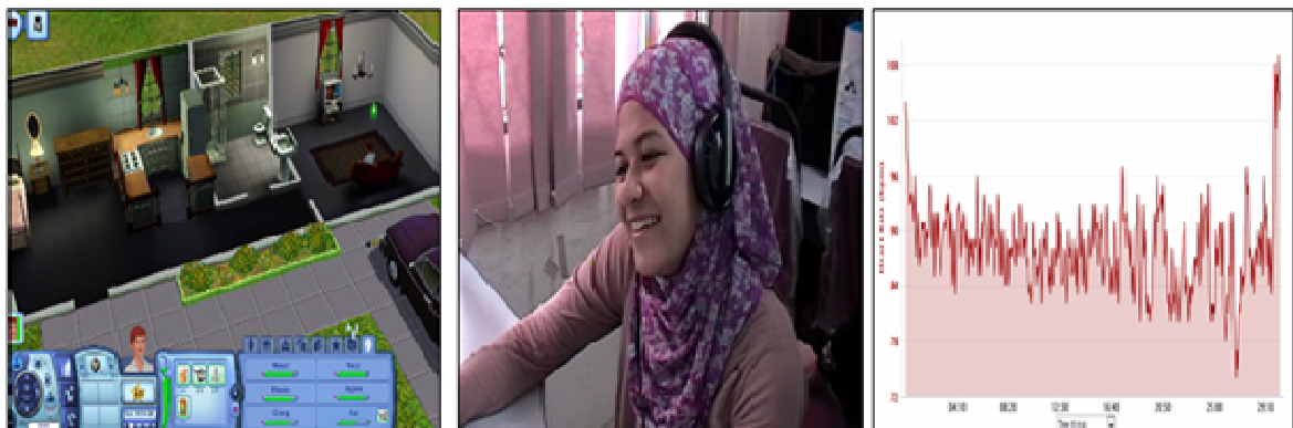
FIGURE 3: (Left) Screen capture of current game activities, (Middle) player's face reaction and (Right) Biometric results using heart rate device.

The experiment took place in a silent room where only one participant and one researcher were present. For the physiological measures, the Garmin Forerunner 610 sports watch with HR monitor, and a touch screen GPS-enabled watch that supports customizable data screens was used (see Figure 2). The Garmin device measures HR by means of a wireless heart-rate monitor strapped around the chest of the test subject. Participants had to wear the Garmin device before they started playing the game. Participants were given 45 minutes to play the game. In addition to the physiological measurements, the participants and the computer screen were video-recorded for analysis. The video footage during the experiment captured participants' facial expressions while Camtasia Studio software was used to record their interaction with the screen. Figure 3 shows one participant during the experiment.