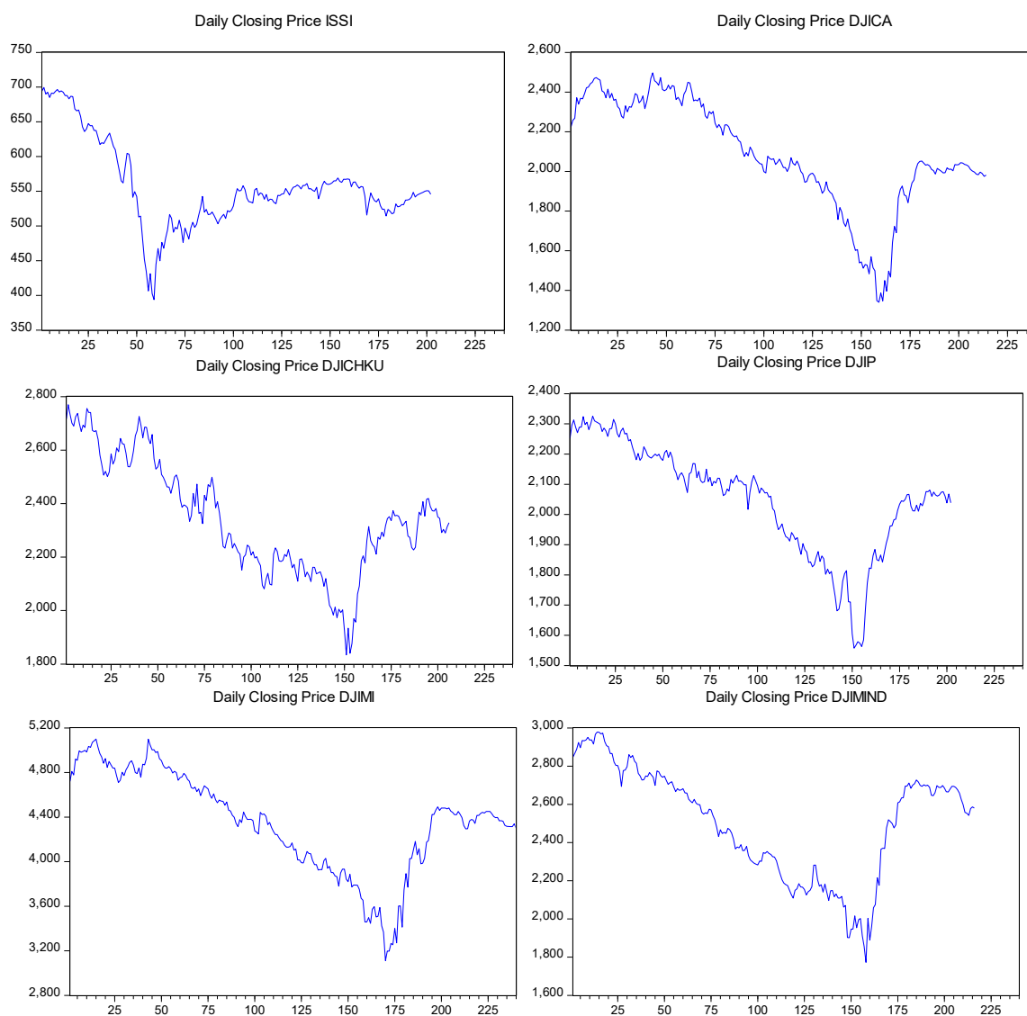
FIGURE 1. Stock Price Movement