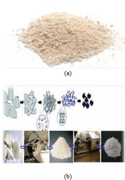
FIGURE 2. The nano-metakaoline, (a): Powder, (b): production process of powder (Mustafa et al. 2019)