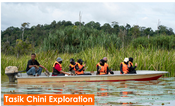
Tasik Chini Exploration