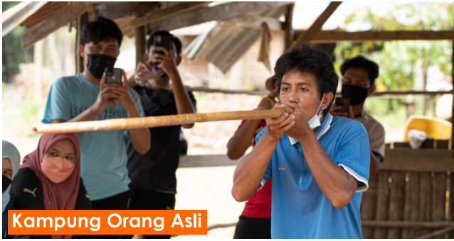
Kampung Orang Asli