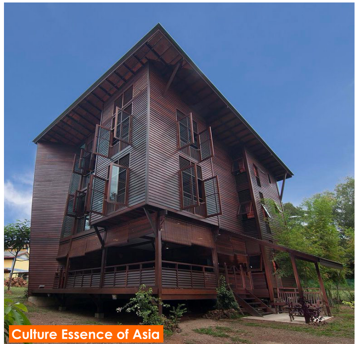
Culture Essence of Asia