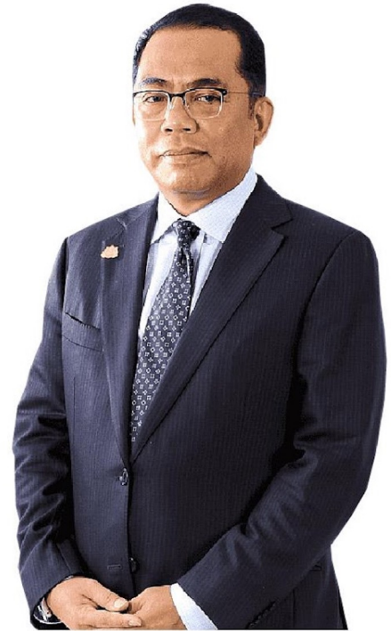
YB Dato' Seri Mohamed Khaled Nordin Minister of Higher Education