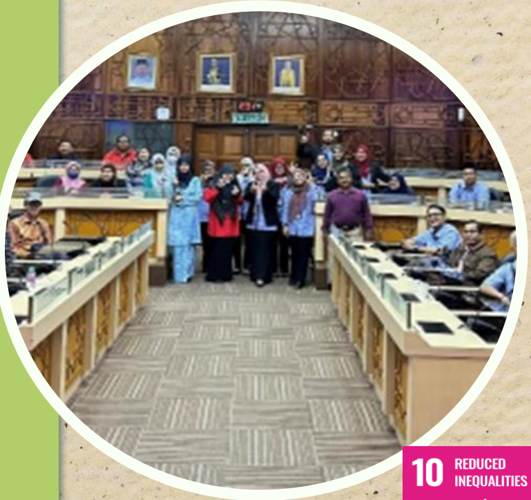
UKM Disabled Staff Strengthening Program in 2023