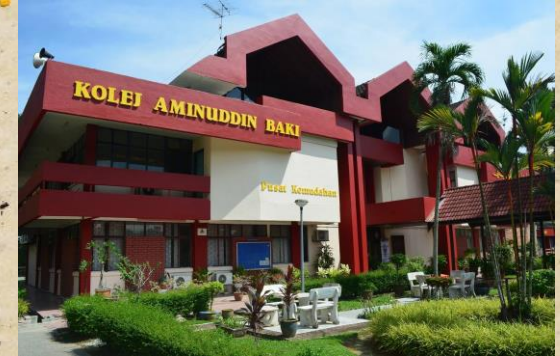
Aminuddin Baki College

https://www.ukm.my/portalukm/residential-college/ungku-omar/