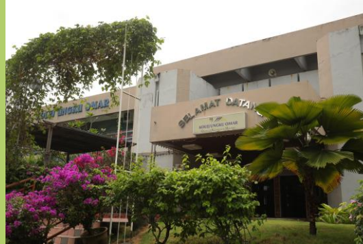
Ungku Omar College

https://www.ukm.my/portalukm/residential-college/dato-onn/