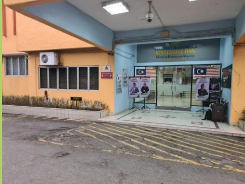
Dato' Onn College

Universiti Kebangsaan Malaysia (UKM) provides residential colleges for students including students with disabilities. UKM has 12 residential colleges which are ten in Bangi Campus and two in Kuala Lumpur Campus. Three residential colleges are suitable for students with disabilities, namely Ungku Omar College (KUO), Dato' Onn College (KDO) and Aminuddin Baki College (KAB). KDO has 1 room for male student and 1 room for female student while KUO has 3 rooms for male students and 3 rooms for female students. KAB has 1 room for female student.