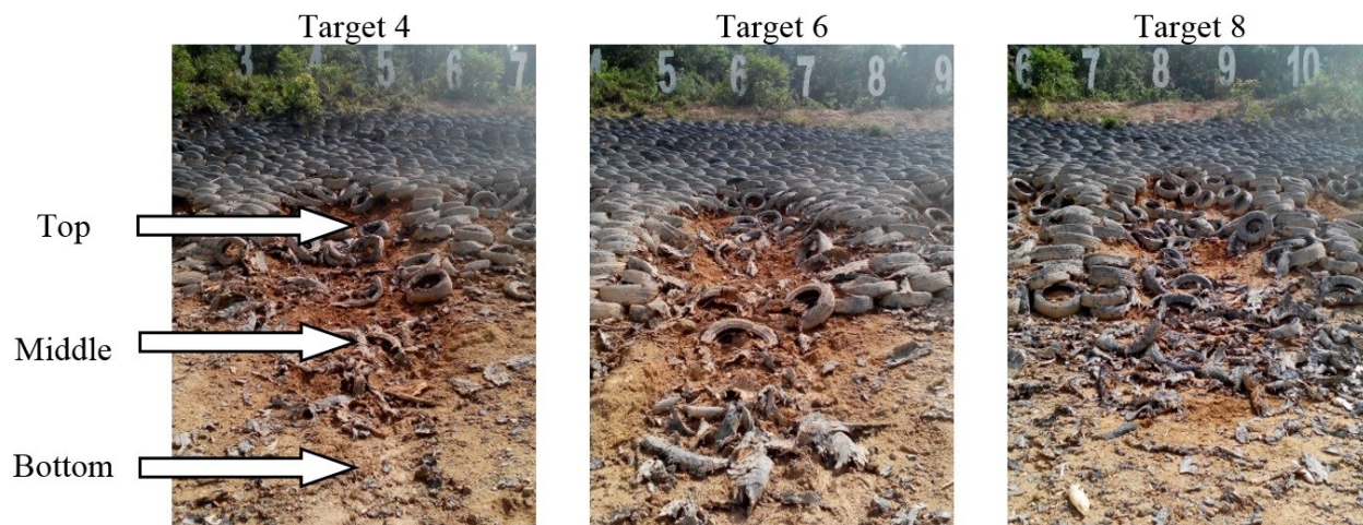
Figure 2. The location of soil sampling points at target 4, 6, and 8